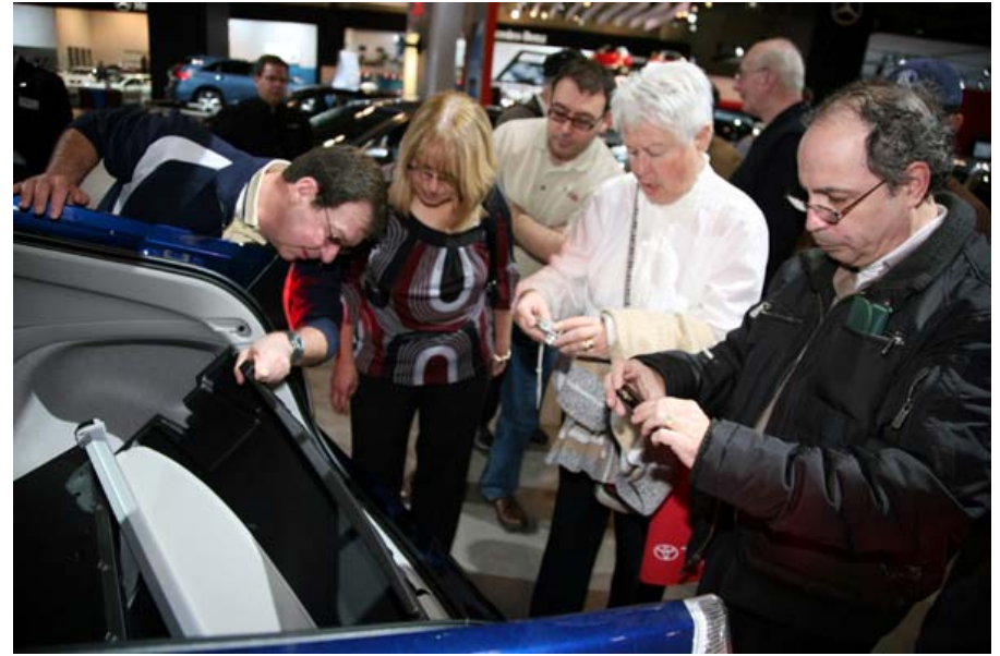
Prius owners info session Canadian International Auto Show, Feb 2009