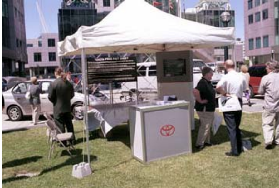
Meet the Prius cross-Canada tour